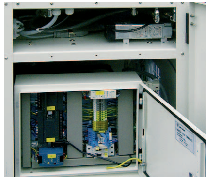
Cooling Aggregate and Control Box

The energy distribution across the whole assembly is homogeneous. Thus three-dimensional assemblies may be processed without any problem.