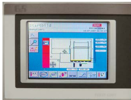
Operational Panel (Colour-Touch-Screen)

The machine's controller unit is located in an integrated control case and comprises switch, control, regulator and safety/fuse elements for all function units. The process is controlled and monitored with a failure message system via microcontroller with colour-touch-screen and intelligent operational panel.