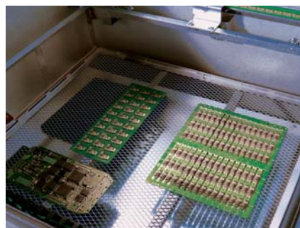
A Glance into the Soldering Zone of the Process Chamber with Work-Piece Carrier and Assemblies

Using vapour as the heat transfer medium the solder product – independent of its size or weight – is homogeneously heated to pre-heat and soldering temperature. Geometric parameters, such as component form, packing density, are unimportant for the heating process. Due to the high density of the vapour the oxygen is displaced from the heating and soldering area. Consequently, no protective gases are necessary.