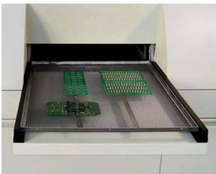
In-feed with work-piece carrier and a variety of assemblies

The modern design of the machines and the physical laws of the process permit to defect-free soldering of the most complicated SMT assemblies even with lead-free solder pastes. Components such as QFPs, BGAs, Flip-Chips as well hybrid assemblies may be processed with high quality results.