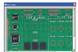
Ersa AUTOPROFILER: Easy offline profiling for highest machine uptimes.