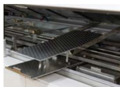
Retractable nozzle sheets for quick maintenance