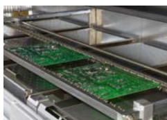
Grip conveyor for extremely thin PCB or flexfoils