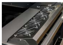
Efficient cooling in outfeed section