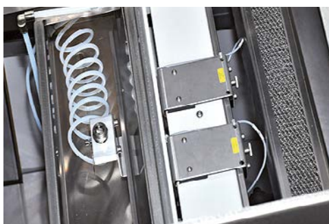
Precision spray fluxer (optional) with blow off device