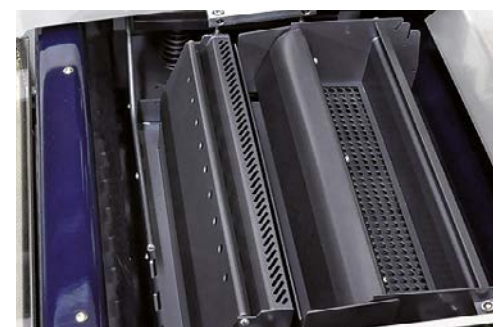
Solder module with pre-solder and finishing nozzle