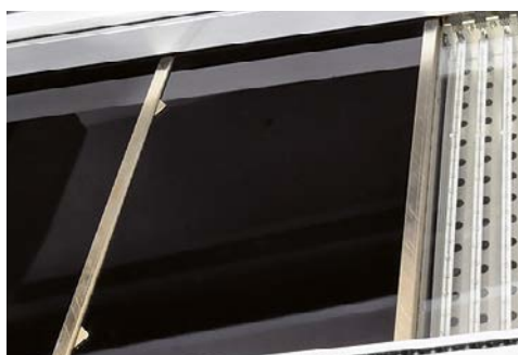
Short wave preheater cassettes and bright emitter set (option)