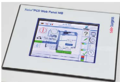
State-of-the-art controls with graphical user interface and touch screen