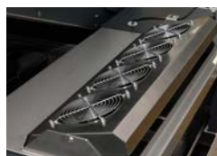
Efficient cooling in outfeed section