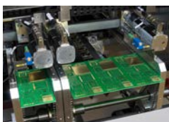
Multi track conveyor for variable PCB width