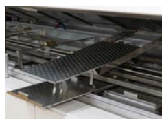
Retractable nozzle sheets for quick maintenance