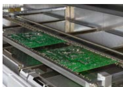
Grip conveyor for extremely thin PCB or flexfoils