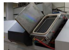
Optimized access to maintenance units