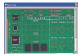
Ersa Autoprofiler: Easy offline profiling for highest machine uptimes.